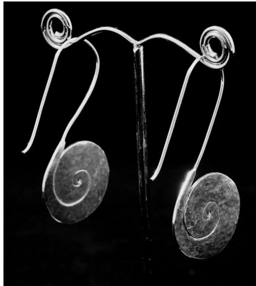
AJE-302 Cut-out Long Spiral Hoop Earrings