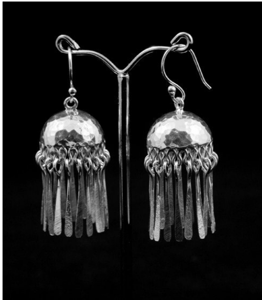
AJE-301 Dome Sterling Silver Earrings