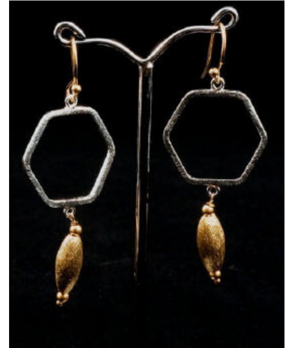
AJE-401c Hexagon Link & Gold Plated Bead Earrings