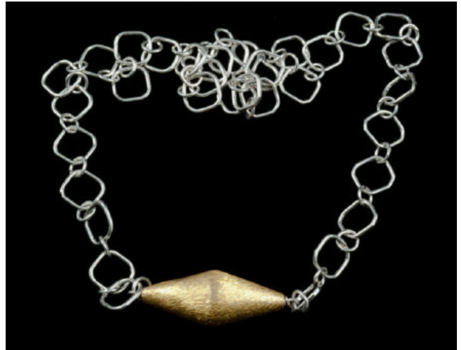
AJN-402 Small Chain with Gold Plated Cone Bead