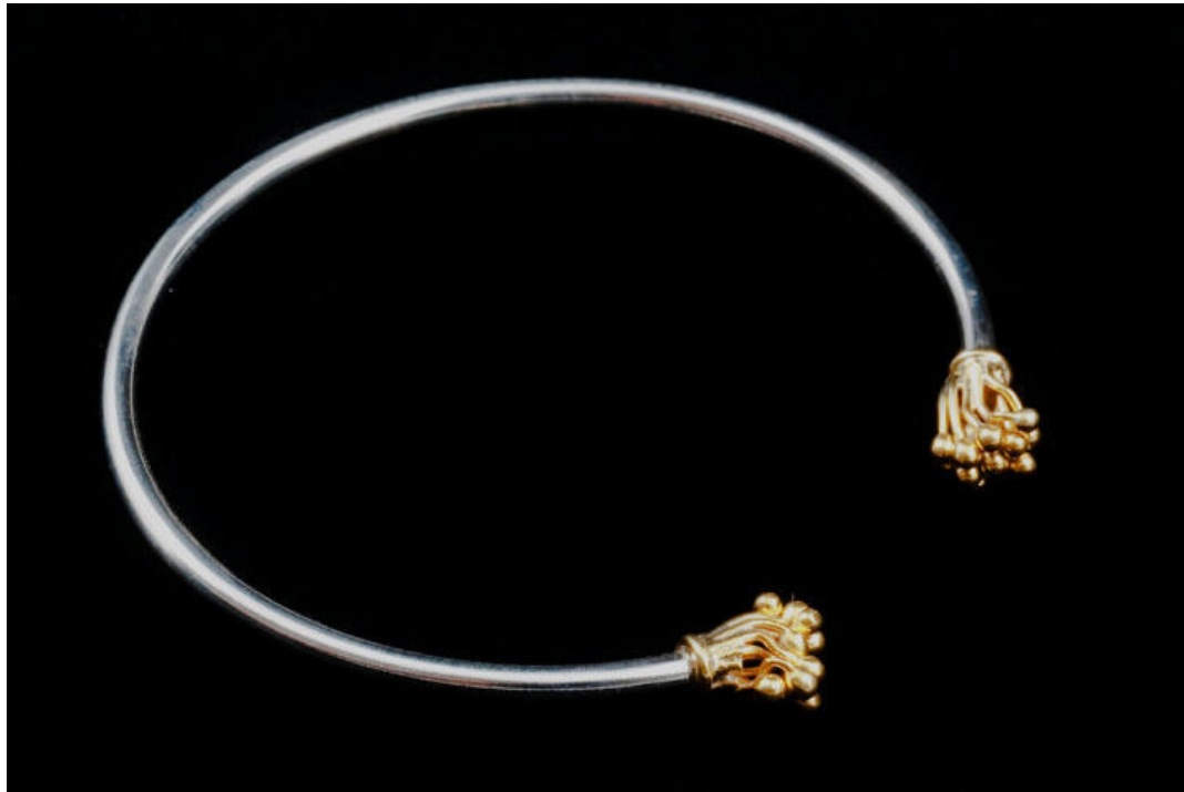
AJB-401 Cuff with Gold Plated Wire Ends