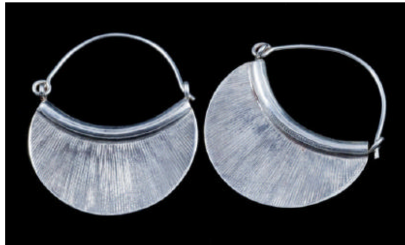
AJE-803 Etched Crescent Hoop Earrings