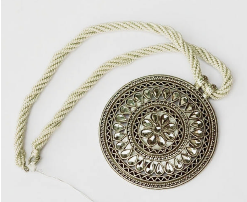
AJN-905 Kundan Round Petals (L) Necklace