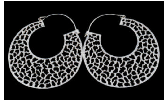
AJE-314 Cut-Out Hoop Earrings