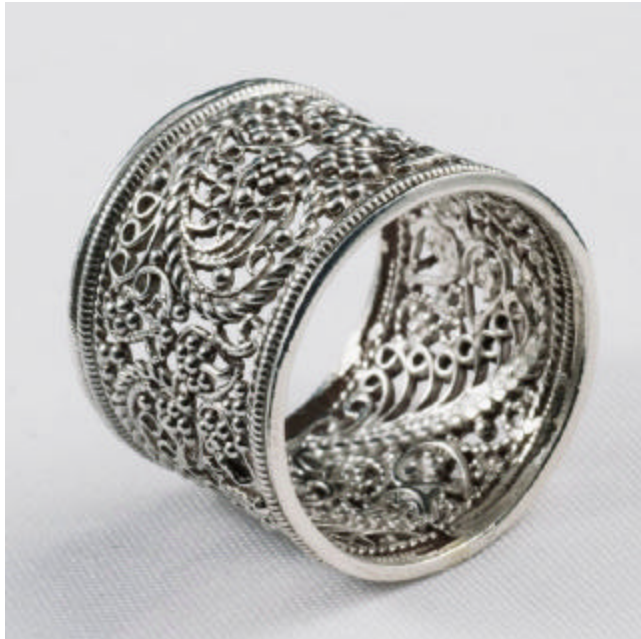
AJR-701 Filigree Ring