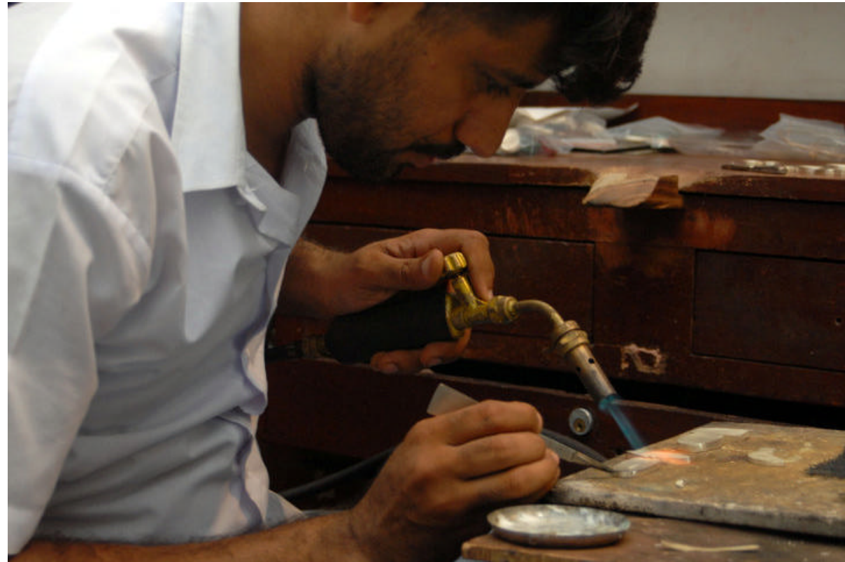
Artisans working on sterling silver pieces of jewelry