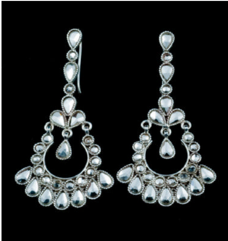
AJE-910 Kundan Chandelier Earrings