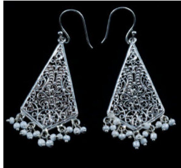
AJE-702 Filigree Kite + Bead Earrings