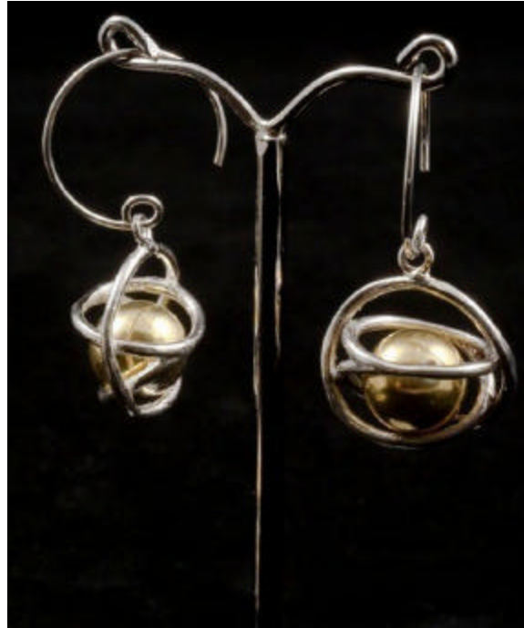
AJE-402 Globe & Gold Plated Bead Earrings