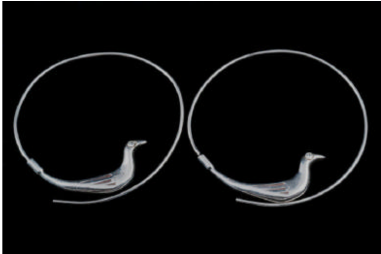
AJE-311 Birds of Flight Earrings