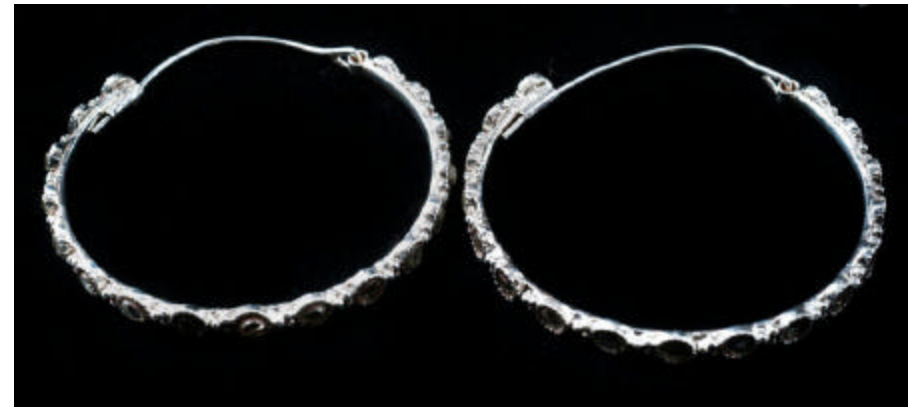
AJE-903 Kundan Large Hoops Earrings