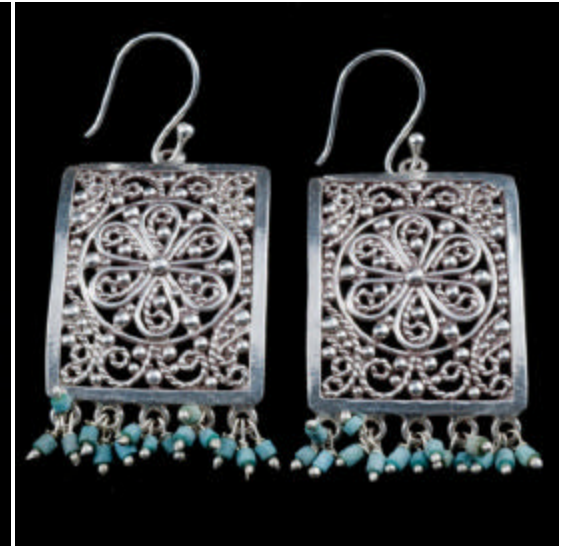
AJE-703 Filigree Rectangle Earrings