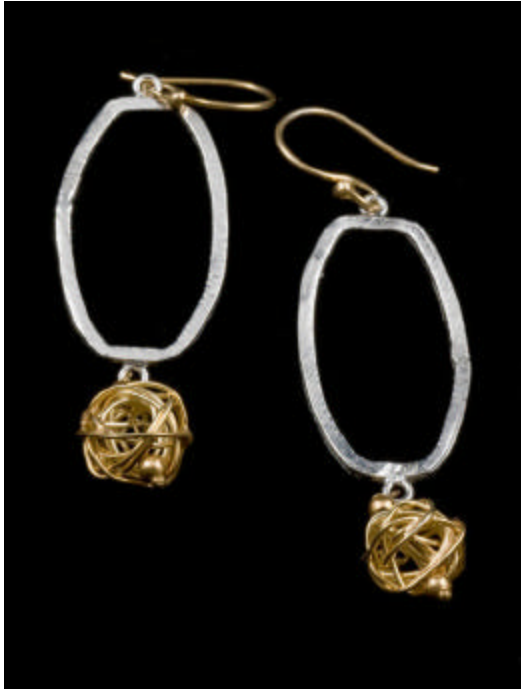
AJE-401b Oval Link & Gold Plated Bead Earrings