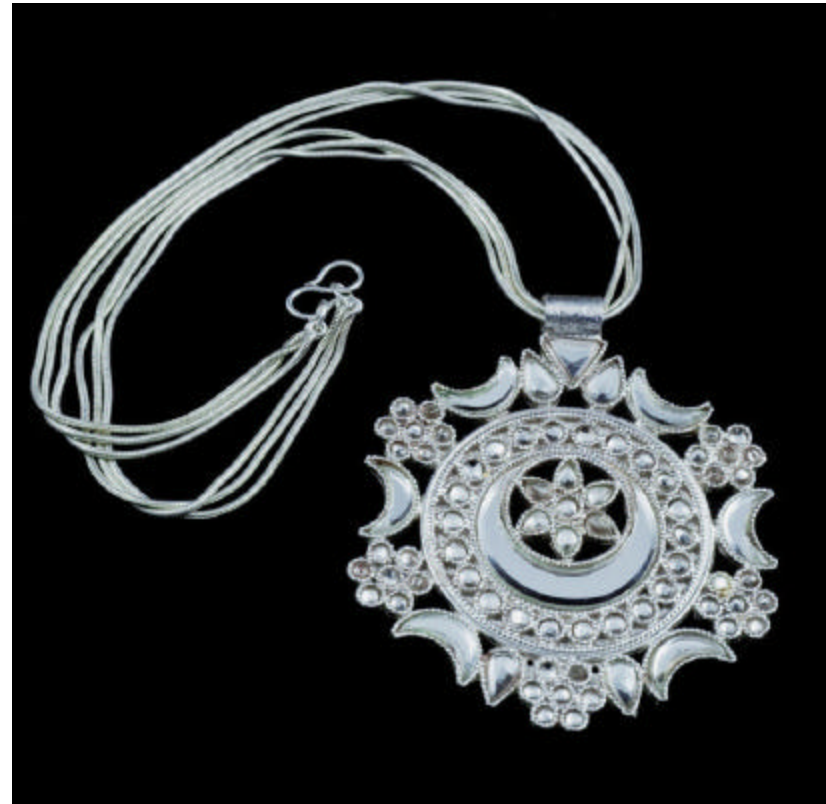
AJN-903 Kundan Crescent Necklace