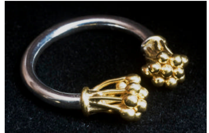
AJR-401 Ring with Gold Plated Wire Ends